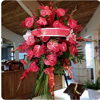
Straub Ohana Standing spray of red anthuriums & red orchids