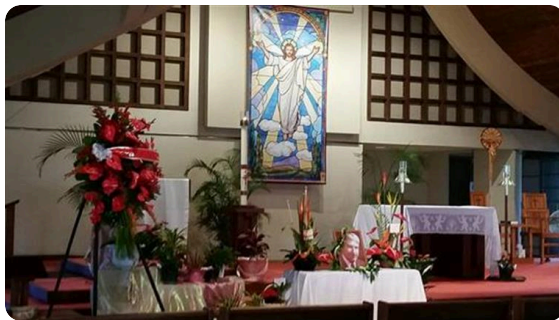
View of Altar